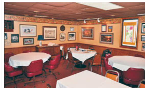
Freddie's II offers a private party room for events, meetings and other functions.