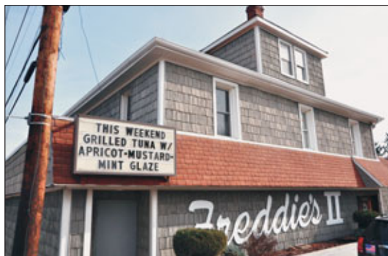
Freddie's II is located at 2789 South Park Road in Bethel Park